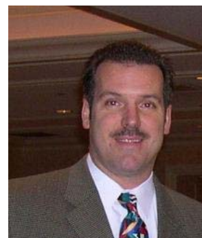
See you in April at Morton Arboretum!

Baseball tickets are sold out for the Cubs/Brewers game in Milwaukee. This is our event with the several other chapters from Wisconsin.