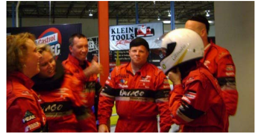
Strategic Planning 2008