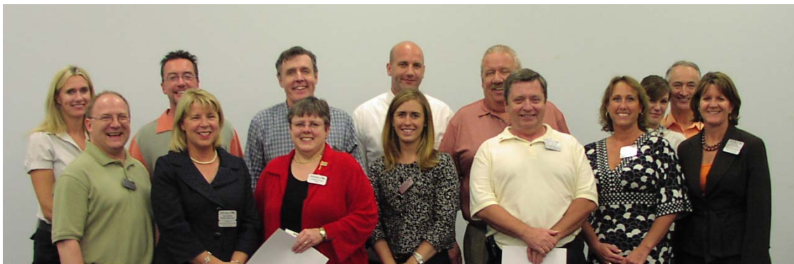
Some of IFMA NI volunteers! Thanks for all of your help throughout the year!!

Mohawk Industries Mr. David's Flooring International Nawkaw Corporation New Haven Noland Sales Organized with Style Ragner Bensen Reike Office Interiors Rentacrate Incorporated Rose Paving Co Shaw Contract Ted Modus Associates TKA + Partners, Ltd. Van Kampen Investments Ware Malcomb Western Waterproofing Whitney, Inc. Deborah Zeitler & Associates